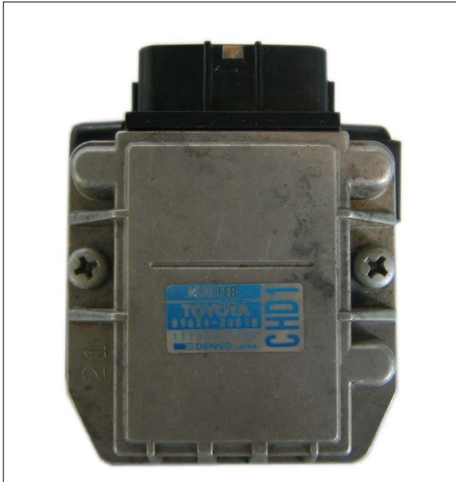
Figure I08.1 - Toyota 1UZFE Igniter