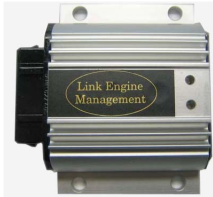
Figure I03.1 - Link Single Channel Igniter