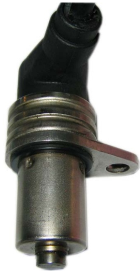
Figure C05.1 - BMW M50 Cam Angle Sensor