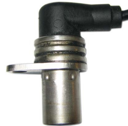
Figure C05.2 - BMW M50 Crank Angle Sensor